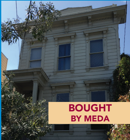
380 San Jose before repairs.

MEDA buys buildings and makes them better to live in.