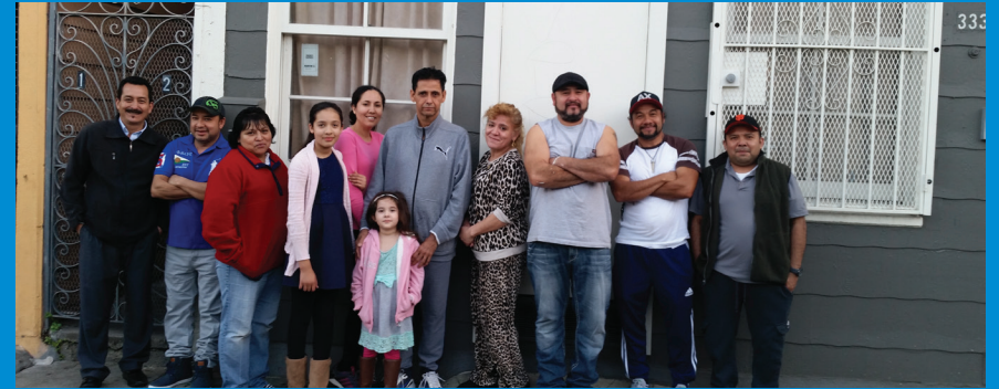
Some of the tenants who can now stay in their home at 3329 20th St.

MISSION PROMISE COMUNIDAD PROMESA DE LA MISION NEIGHBORHOOD