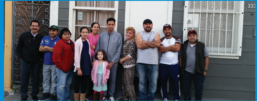
Some of the tenants who can now stay in their home at 3329 20th St.

MISSION PROMISE COMUNIDAD PROMESA DE LA MISION NEIGHBORHOOD