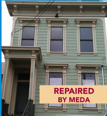
380 San Jose after repairs.

Call MEDA to save your home! (415) 282-3334 ext. 123.