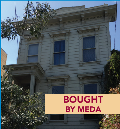
380 San Jose before repairs.

MEDA buys buildings and makes them better to live in.