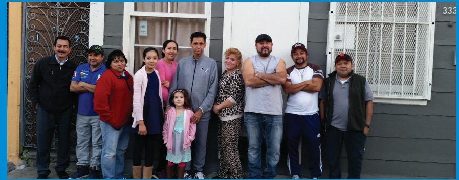
Some of the tenants who can now stay in their home at 3329 20th St.

MISSION PROMISE COMUNIDAD PROMESA DE LA MISION NEIGHBORHOOD