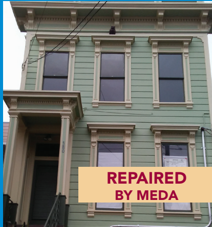
380 San Jose after repairs.

Call MEDA to save your home! (415) 282-3334 ext. 123.